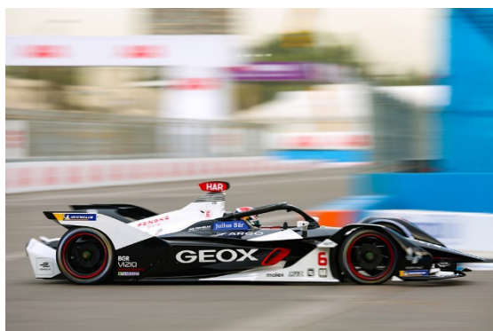
Penske Autosport EV4 Formula E race car

At Integral e-drive we are pushing to maximise all these advantages and to make them available to clients in quality assured products. The attribute of extreme power density is a key enabler for many of our clients, enabling them to achieve vehicle level goals that would not otherwise be possible. Power density is inextricably linked with the identification and minimization of any losses as the operational frequency is increased whilst meeting often conflicting mechanical, thermal and insulation system requirements. This is an area that responds extremely well to innovation and one way to really fast-track innovation is to go racing.