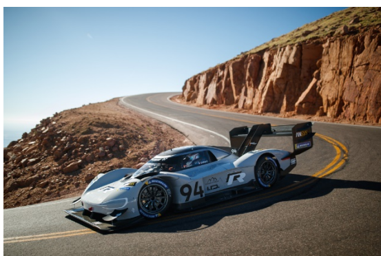
Volkswagen Motorsport's 2018 Pikes Peak ID. R race car

Much of our work is confidential but, on rare occasions, some clients will allow us to publish our involvement and one such instance was our role in providing the integrated motor inverter systems for VW’s IDR 2018 Pike’s Peak car. This was the first time that an electric vehicle beat an open class field of IC engines in a premium motorsport event and it smashed the course record in the process.